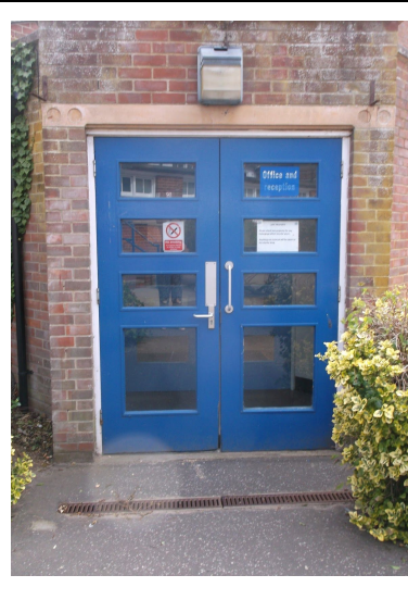
Your entrance into school