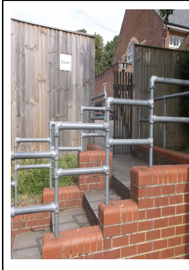
Infant Entry Gate